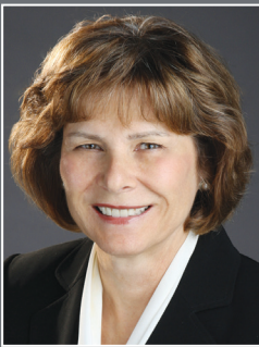
Judge Deborah D. Fleck (Ret.)

Resolve your Family Law case for just $650 per party.